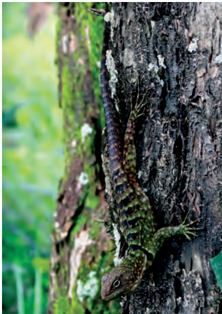
Figure 1. Uncollected specimen of Stenocercus bolivarensis at the campus of the University of Quindío, Armenia, Quindío, Colombia.

After three decades (31 years) of no other records, herein we report the first record of S. bolivarensis (Figure 1) collected in University of Quindío campus (04°33'16.6" N, 075°39'35.4" W, 1485 m a.s.l.), in the department of Quindío, municipality of Armenia (Figure 2). A single male specimen was collected and deposited in the Herpetological Collection of the University of Quindío (Herpetos-UQ) (Herpetos-UQ 0282, snout-vent length = 81 mm, tail length = 92 mm) (Figure 3), in February 19 th , 2013. Furthermore, three uncollected individuals were observed in the same locality at a distance of 1.6 m within bark cracks