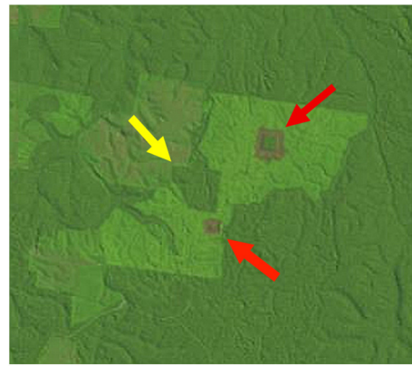
Fig. 1. A LANDSAT image from the BDFFP study area in July 1992 showing fragments of different sizes and vegetation of different ages at Fazenda Porto Alegre. The largest fragment (100-ha, yellow arrow) is surrounded by both a mature border and matrix, whereas the smaller two fragments (1- and 10-ha, red arrows) are surrounded by young borders and a mature matrix.

We used an information-theoretic framework to model feather growth rate as a function of landscape characteristics with data from all species combined. Since we interested in evaluating the effect of second-growth vegetation in edges and the matrix on the nutritional condition of birds living inside the fragments, our variable set was composed of fragment size, border status, and age of